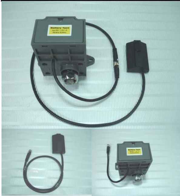
362DC-B2 Sensor Unit